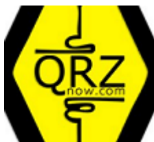
Real-time band conditions