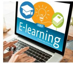
The Learning Page