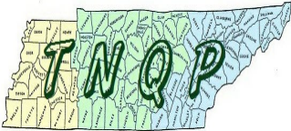
Tennessee QSO Party TNQP