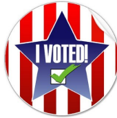
The Vote Is In