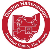
HAMVENTION QSO PARTY