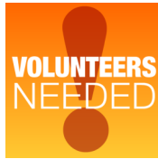
TCG Website Maintenance Volunteers Needed